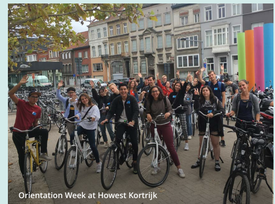
Orientation Week at Howest Kortrijk