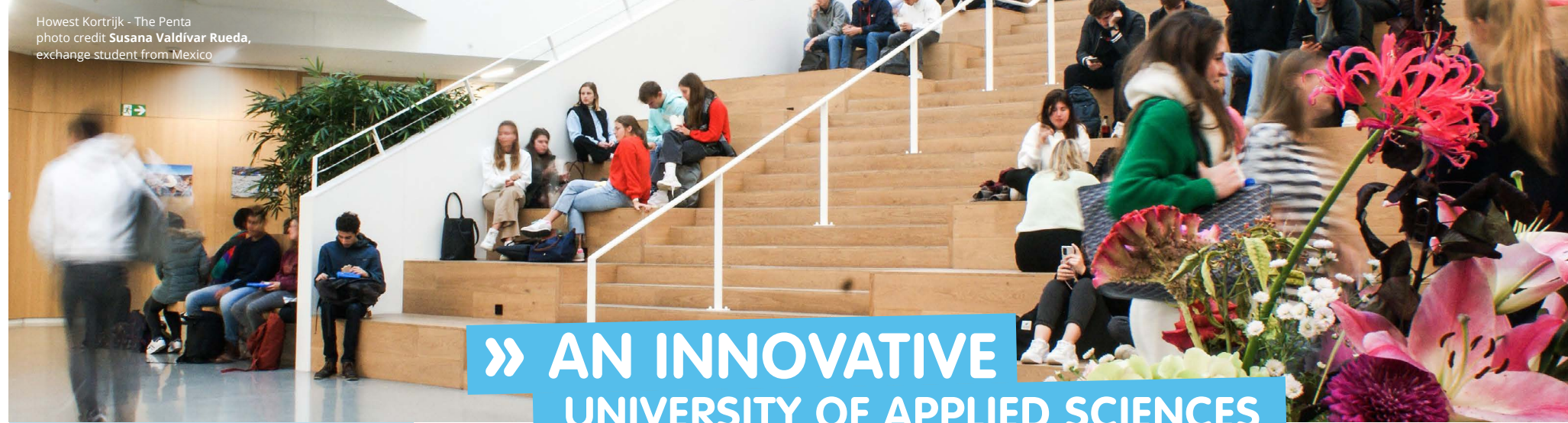
Howest Kortrijk - The Penta